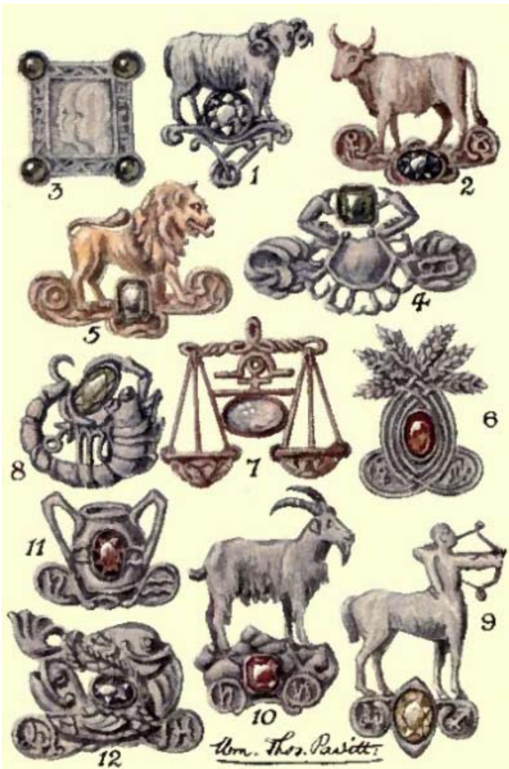
GEMS, SYMBOLS, AND GLYPHS OF THE ZODIAC.